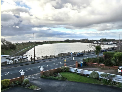
9, Grannys Bay, 265, Inner Promenade, Lytham St Annes, FY8 1AZ

This very spacious second floor two bedroomed purpose built apartment is situated in a select development known as 'Grannys Bay', constructed by local builder Keith Bell. Offering a most convenient location within just a few minutes stroll to Ansdell's thriving shopping facilities on Woodlands Road together with the station and there are transport services within 100 yards leading to both Lytham and St Annes main centres. The apartment has a SUN BALCONY with panoramic views across GRANNY'S BAY with the beach and foreshore beyond and adjoins FAIRHAVEN LAKE with its many leisure and sporting attractions. Viewing strongly recommended to appreciate the spacious accommodation this apartment has to offer. No onward chain.